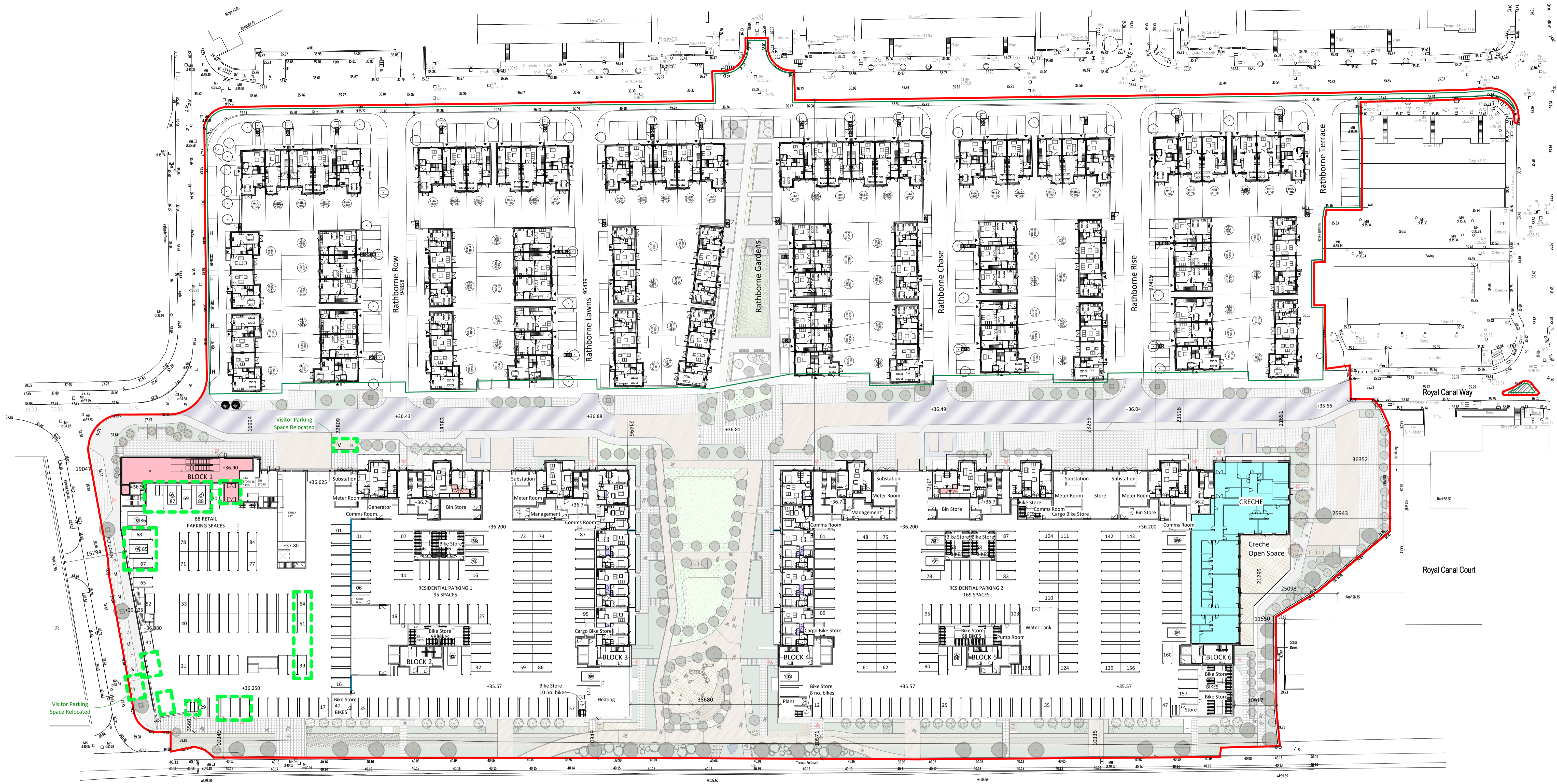
1 Pro-Site Plan - Ground Floor 1:500

Red line indicates site under application.