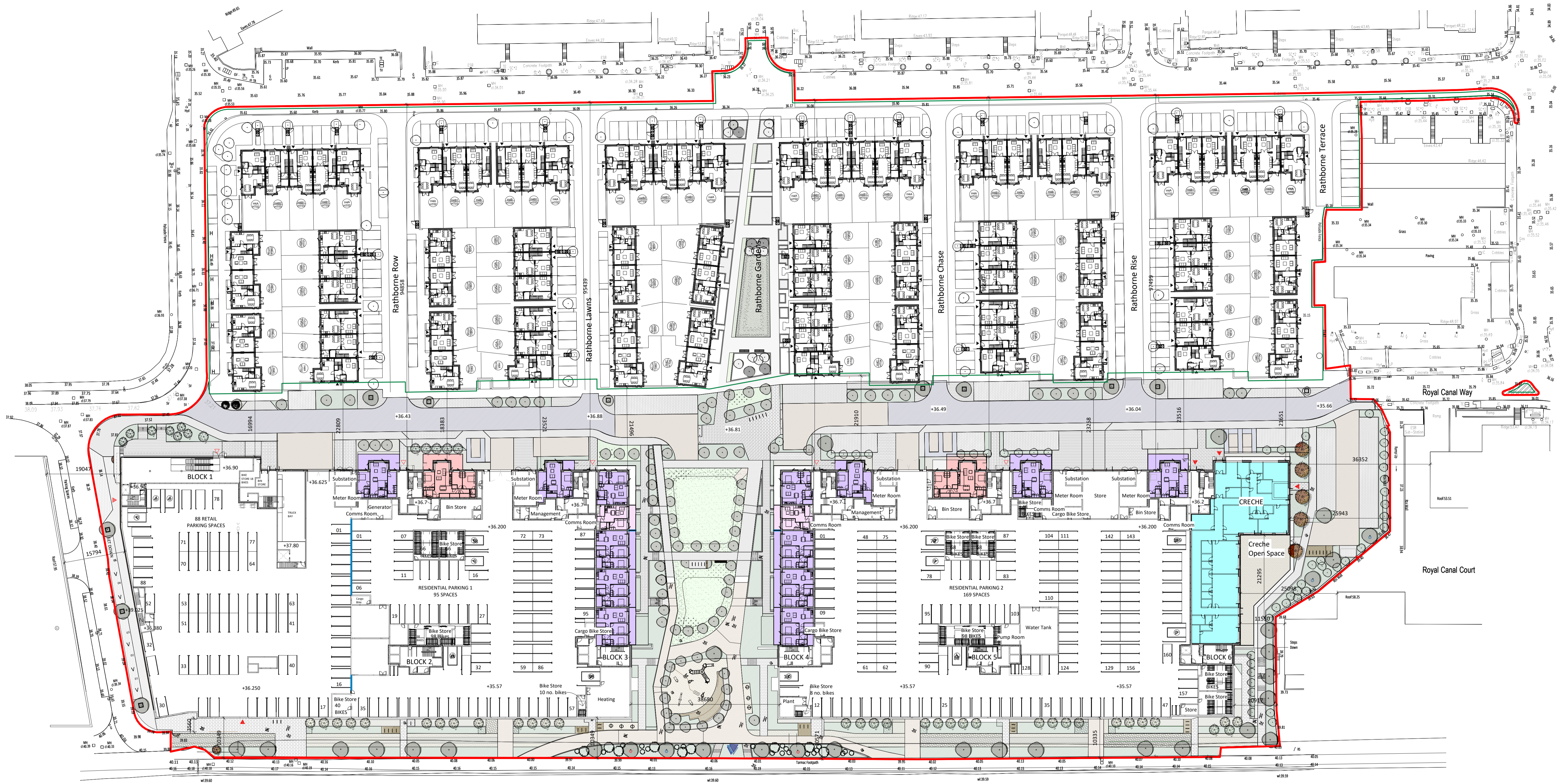
1 Pro-Site Plan - Ground Floor 1:500

Red line indicates site under application.