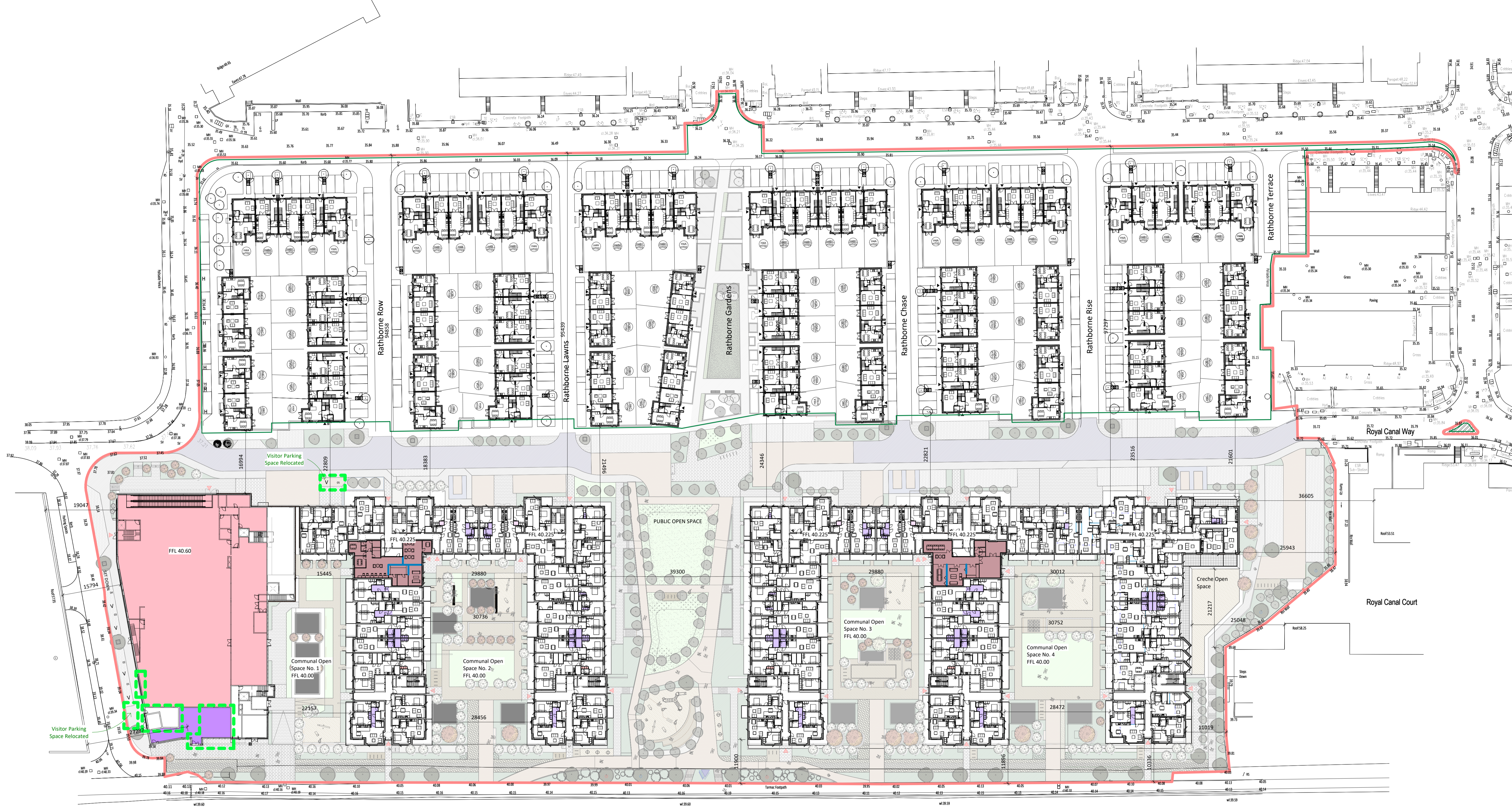
1 Pro_Site Plan - Podium Level 1 : 500

Red line indicates site under application. Area outlined in green indicates 92 houses granted under application DCC Reg. Ref-3666/15