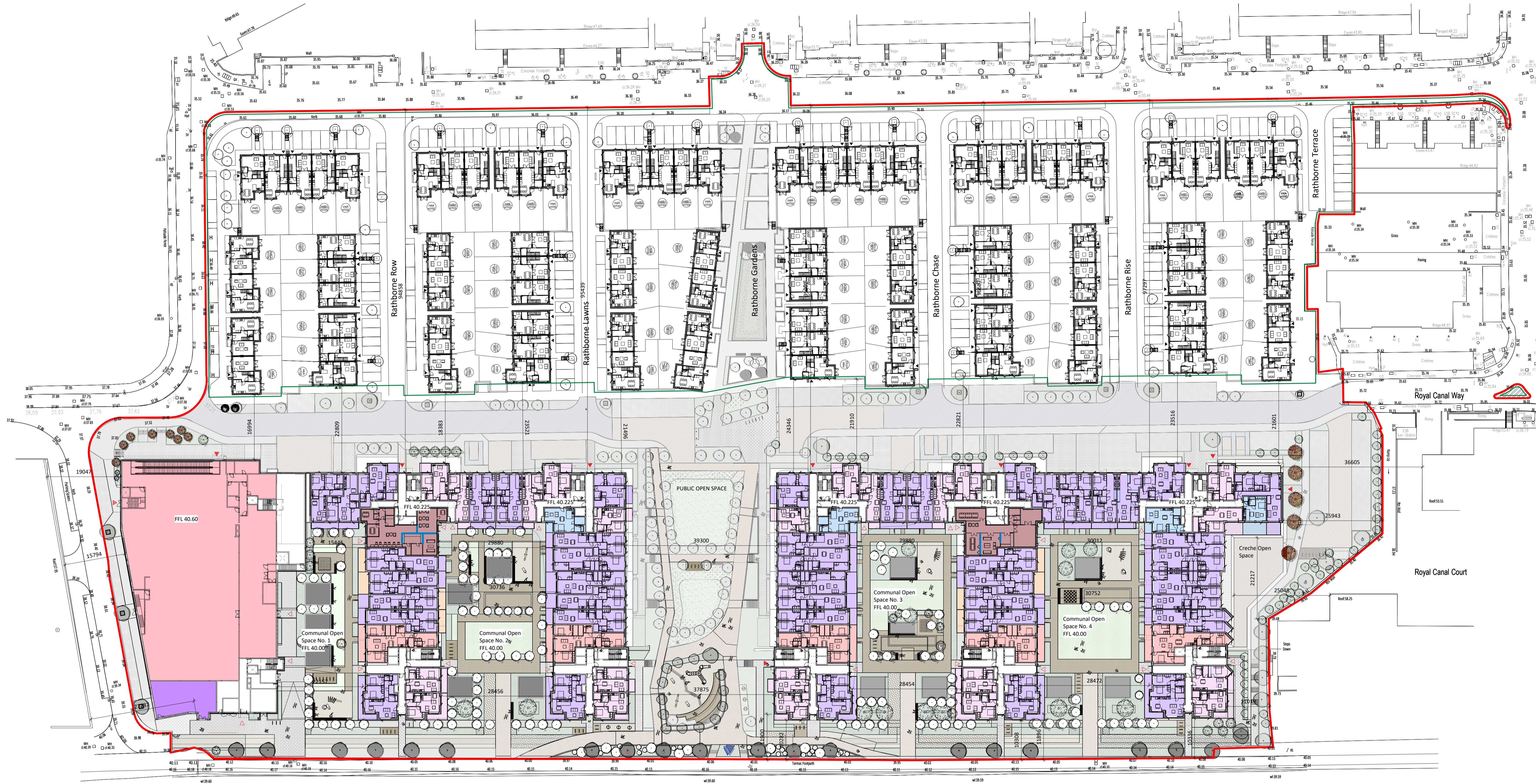
1 Pro_Site Plan - Podium Level 1:500

Red line indicates site under application. Area outlined in green indicates 92 houses granted under application DCC Reg. Ref-3666/15